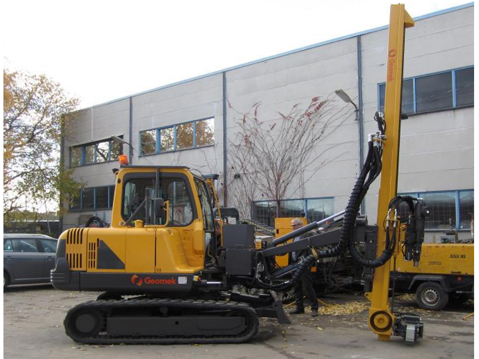
EC55 with drilling/piling rig

CeDe Group and Geomek together delivered an EC55 with a drilling/piling rig. The machine is extremely compact with low transport height and good manoeuvrability. The EC55 can be used for drilling or piling at smaller ground reinforcement sites. The EC55 is the perfect carrier for this application, with a good hydraulic capacity and a comfortable cab. The rig can be equipped with a hydraulic