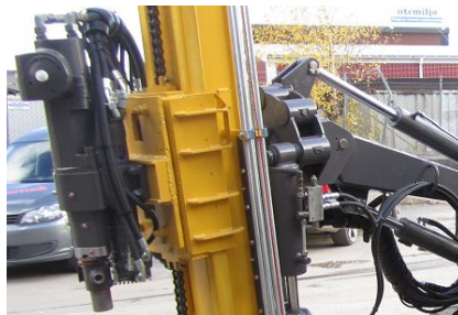
Hydraulic rotary head

drifter KLEMM KD408, a rotary head KLEMM KH4 or a hydraulic piling hammer Furukawa F9.